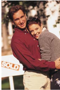
Call Your NHF Approved Lender Today to Get Started

Find out today how easy we make purchasing a home.